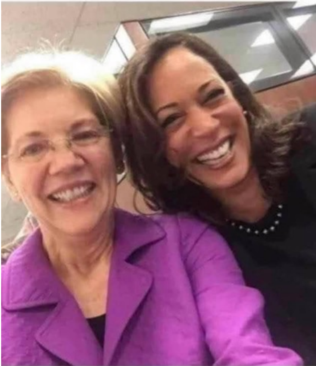
Lying Dog and Spread Eagle